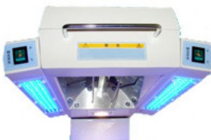
ESBL-60 phototherapy unit