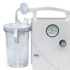
Low pressure Aspirator