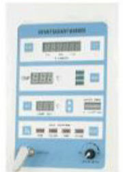
Air Temp count up/down timer