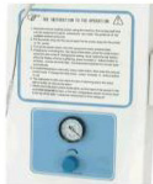
Built-in Low pressure Aspirator